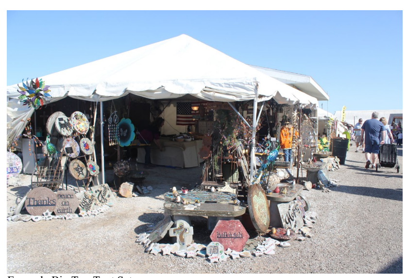
Example Big Top Tent Setup

*Weekly Rental Cost is for the tent only. This does not include space fees, storage fees, or any other fees that may apply from the market.